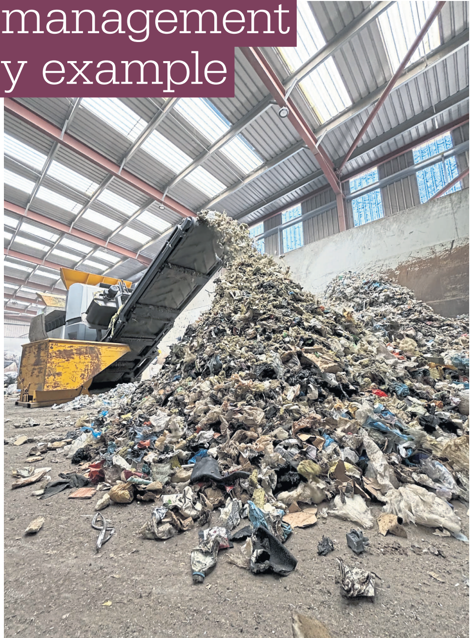
Above, shredded waste at PSH Environmental. Inset left, baled refuse-derived fuel. Below, the business is based at the Rackheath industrial estate in Norwich

For more information, visit parker skips.com