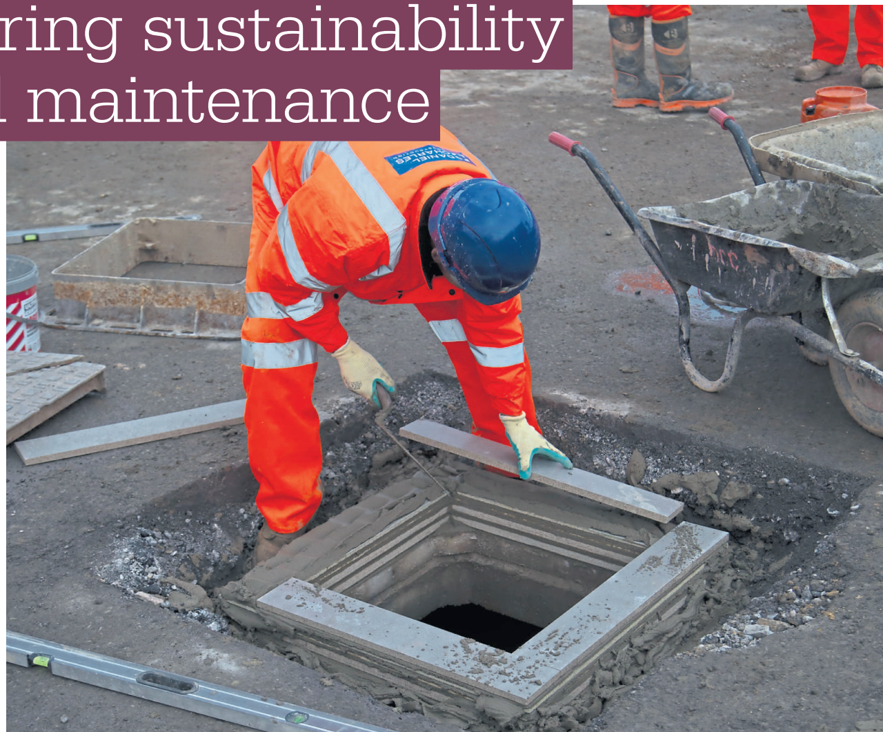
SHIMPAC® is a road seating and levelling ironwork product that has sustainability at its core, from the materials it's made from to the reduction in carbon emissions due to its efficient install and minimal maintenance requirements

The simplicity of installation means fewer emissions associated with the use of heavy machinery and reduced energy