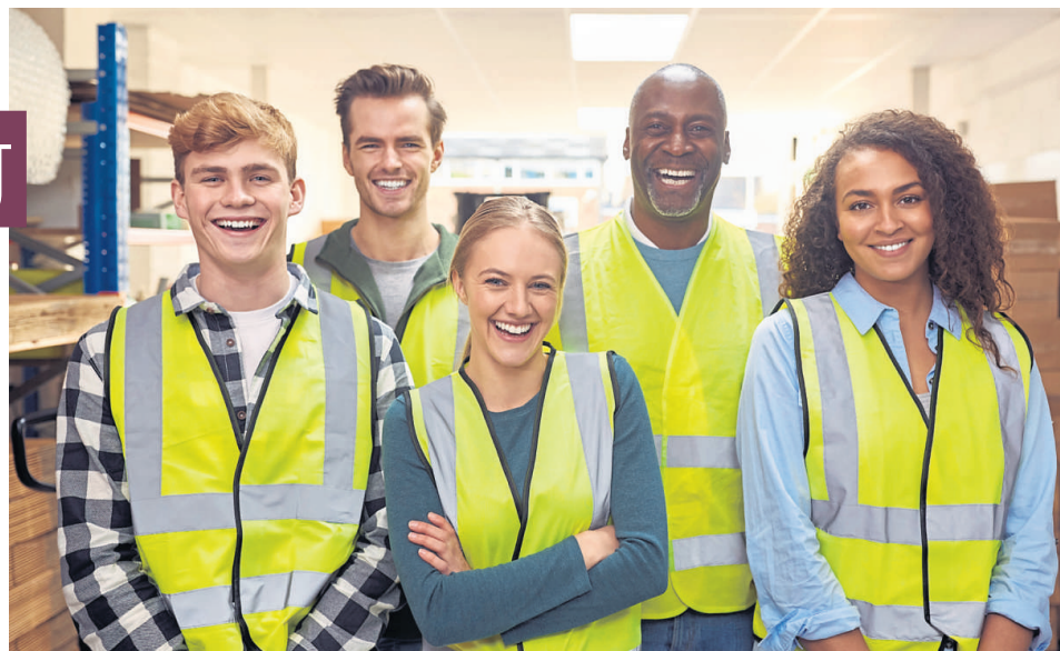
East Anglia has an active business community spanning multiple sectors