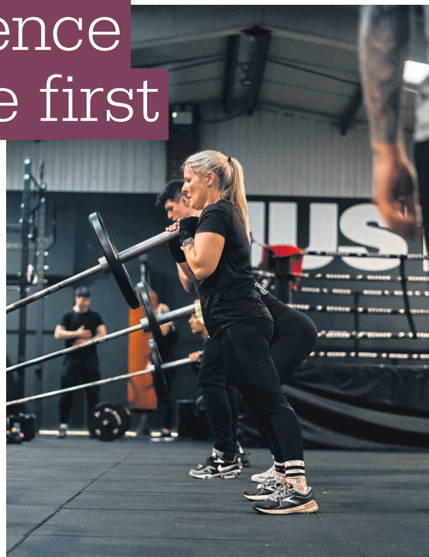
Hustle is a classes-only gym where members are coached to meet their goals

For more information, visit doyouhustle.co.uk